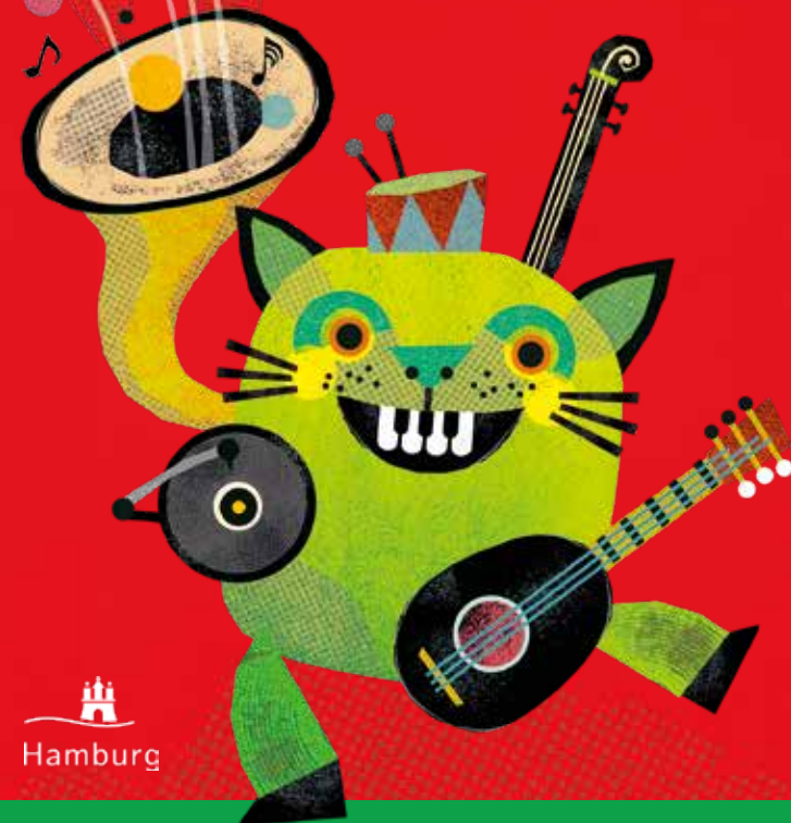
Illustration: Julia Neuhaus

music for children: excitingly different