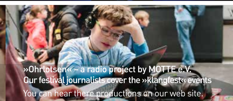
Illustration: Frances Cony